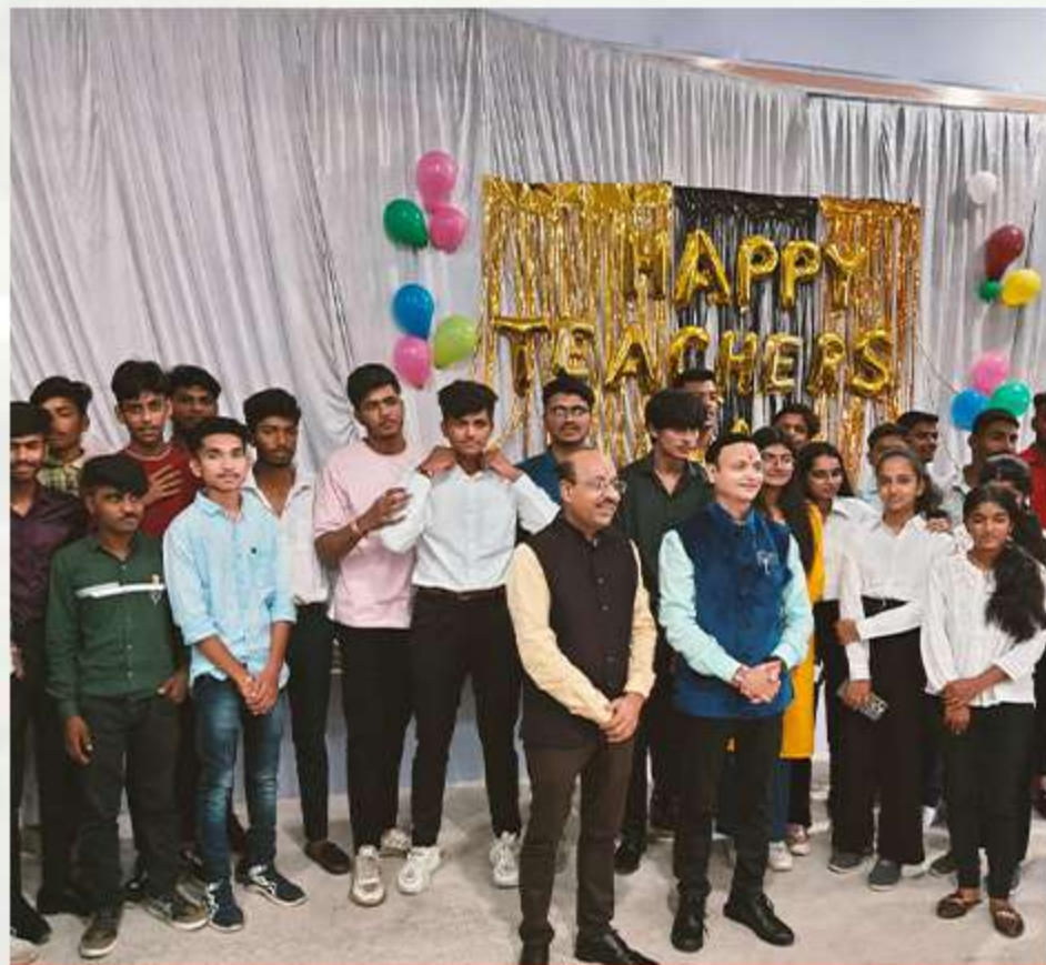
Teachers day celebration.