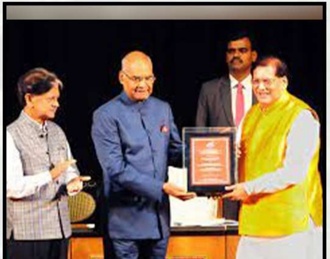
Dr. Bindeshwar Pathak, Recipient, LBS Award 2017