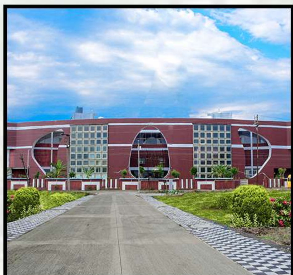
LBSIM, INDORE (ESTABLISHED IN 2014)