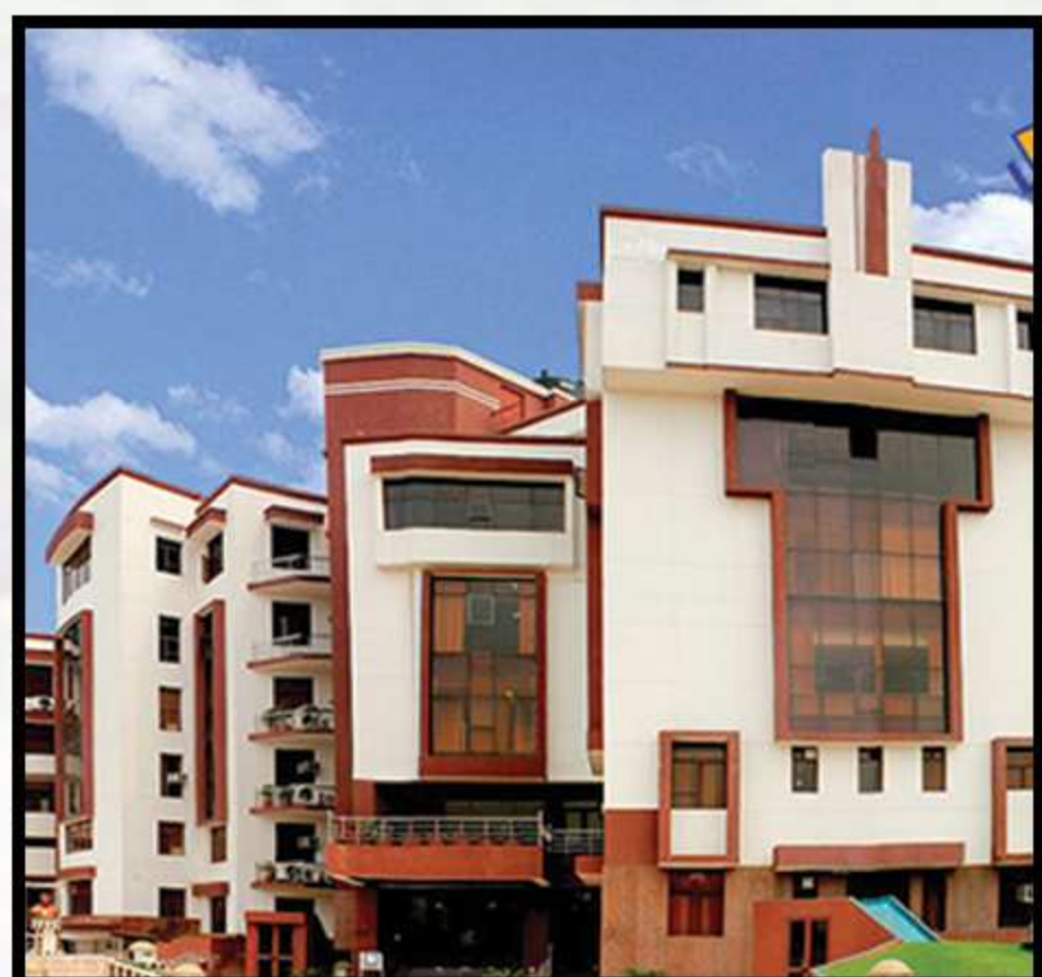
LBSIM, DELHI (ESTABLISHED IN 1995)