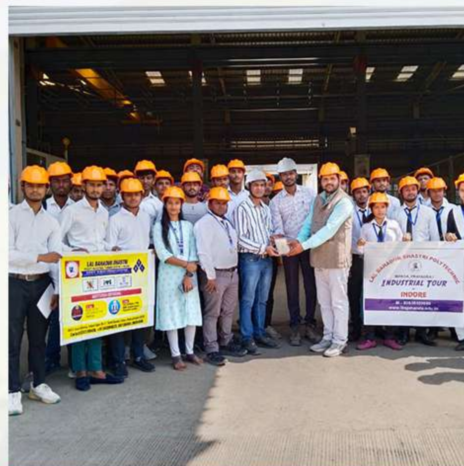
Students industrial visit at Hindustan Equipment pvt ltd.