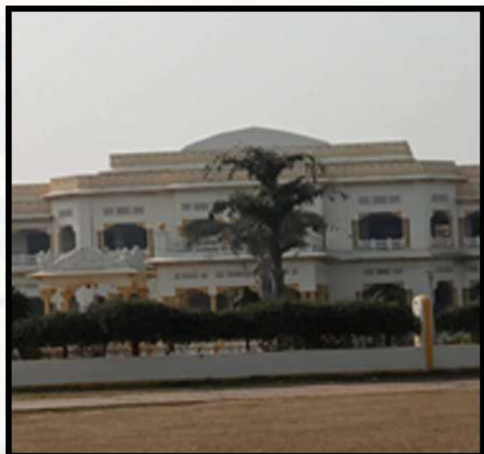
LAL BAHADUR SHASTRI INTER COLLEGE IN KARCHHANA, ALLAHABAD (ESTABLISHED IN 1968)