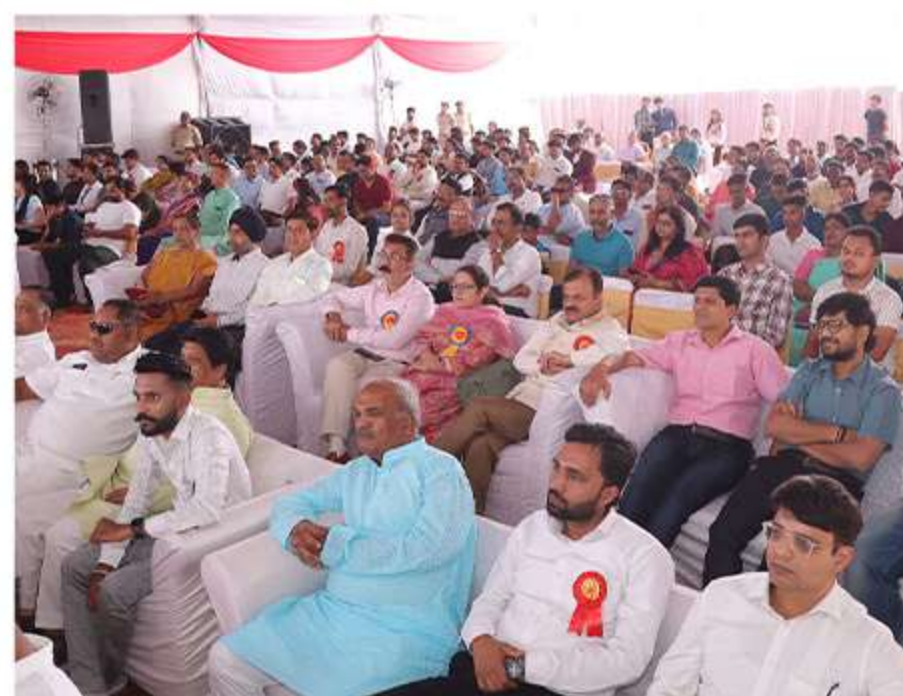
Shree Mangubhai Patel, Hon'ble Governor, Madhya Pradesh unveiled Lal Bahadur Shastri Ji's Statue at LBSITM Campus in 2023