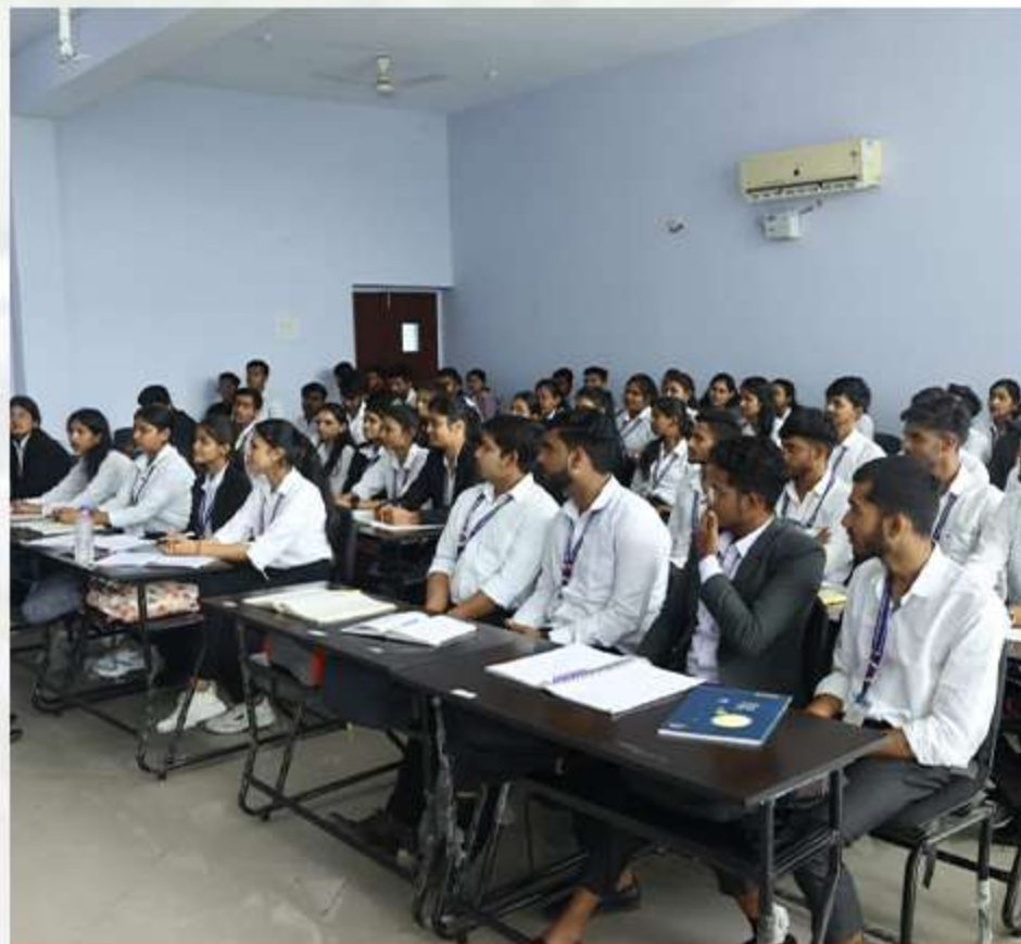
Ed-tech-upgraded classroom that enhances the teaching and learning process.