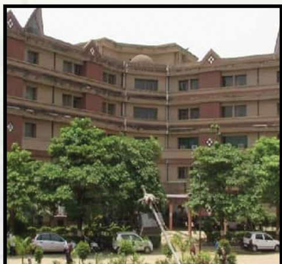
LBSP, PRAYAGARAJ (ESTABLISHED IN 2014)