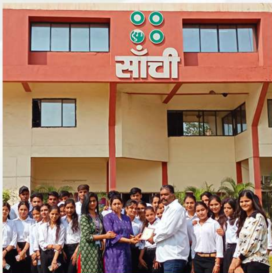
Students industrial visit at Sanchi Milk - Mangliya Dairy Products Plant.