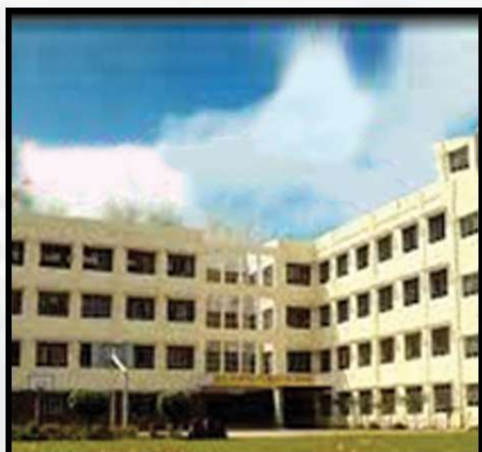
LALITA SHASTRI PUBLIC SCHOOL (ESTABLISHED IN 1993)