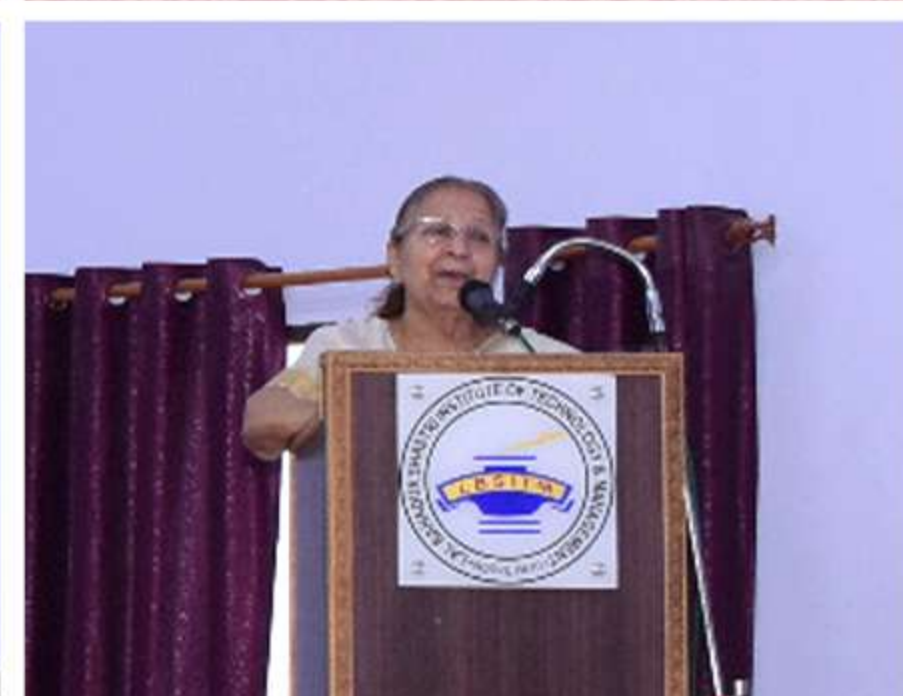
Smt Sumitra Mahajan Former Loksabha Speaker as a Chief Guest in Shikshak Samman Samaroh at LBSITM Campus in 2023

A Centre of Excellence in Professional Education