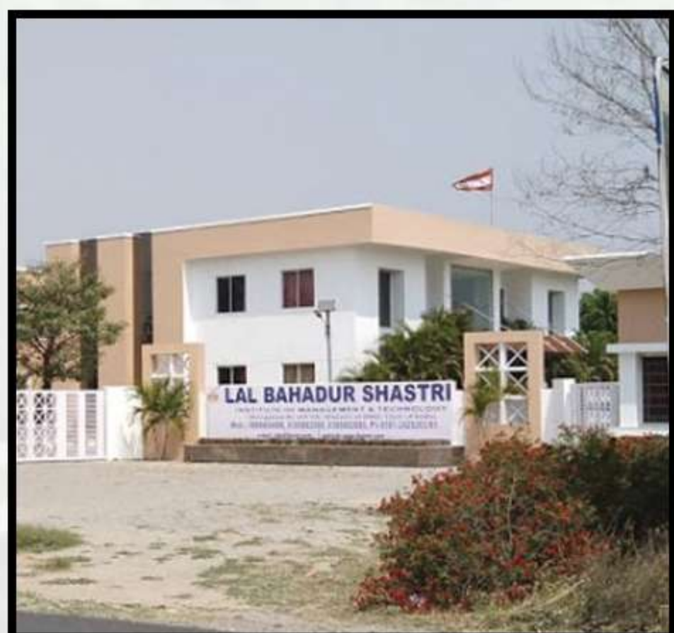
LBSIMT, BAREILLY (ESTABLISHED IN 1996)